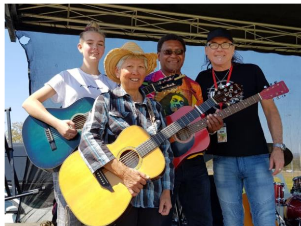
Workshop attendees performing at fRETfEST @ fORRIE – RADF Funded 2019